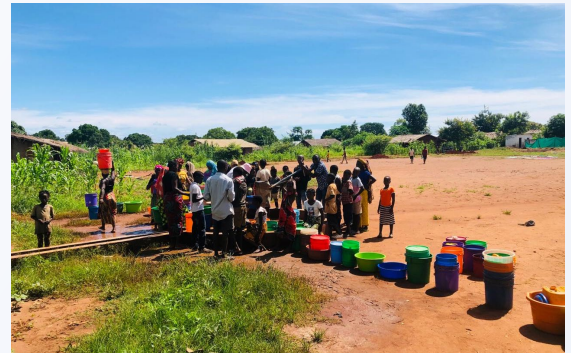
IOM CCCM is engaging service providers to ensure support to the affected populations.