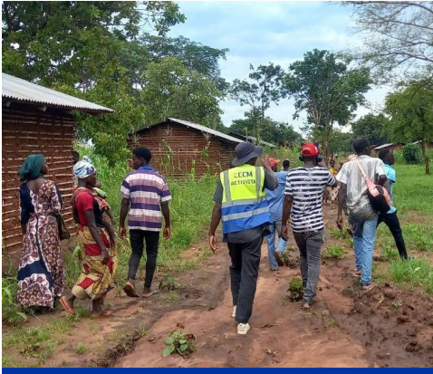
IOM CCCM allocated empty shelters to new arrivals in Meculane Center in Chiure District