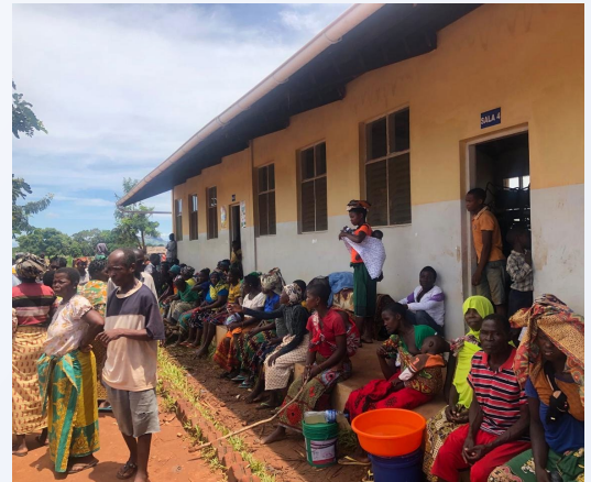
Nacuxa School in Erati District is currently a Transit Center hosting over 1,200 IDPs from Chiure