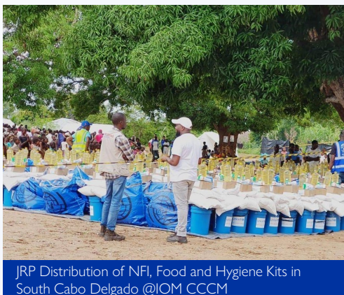
JRP Distribution of NFI, Food and Hygiene Kits in South Cabo Delgado